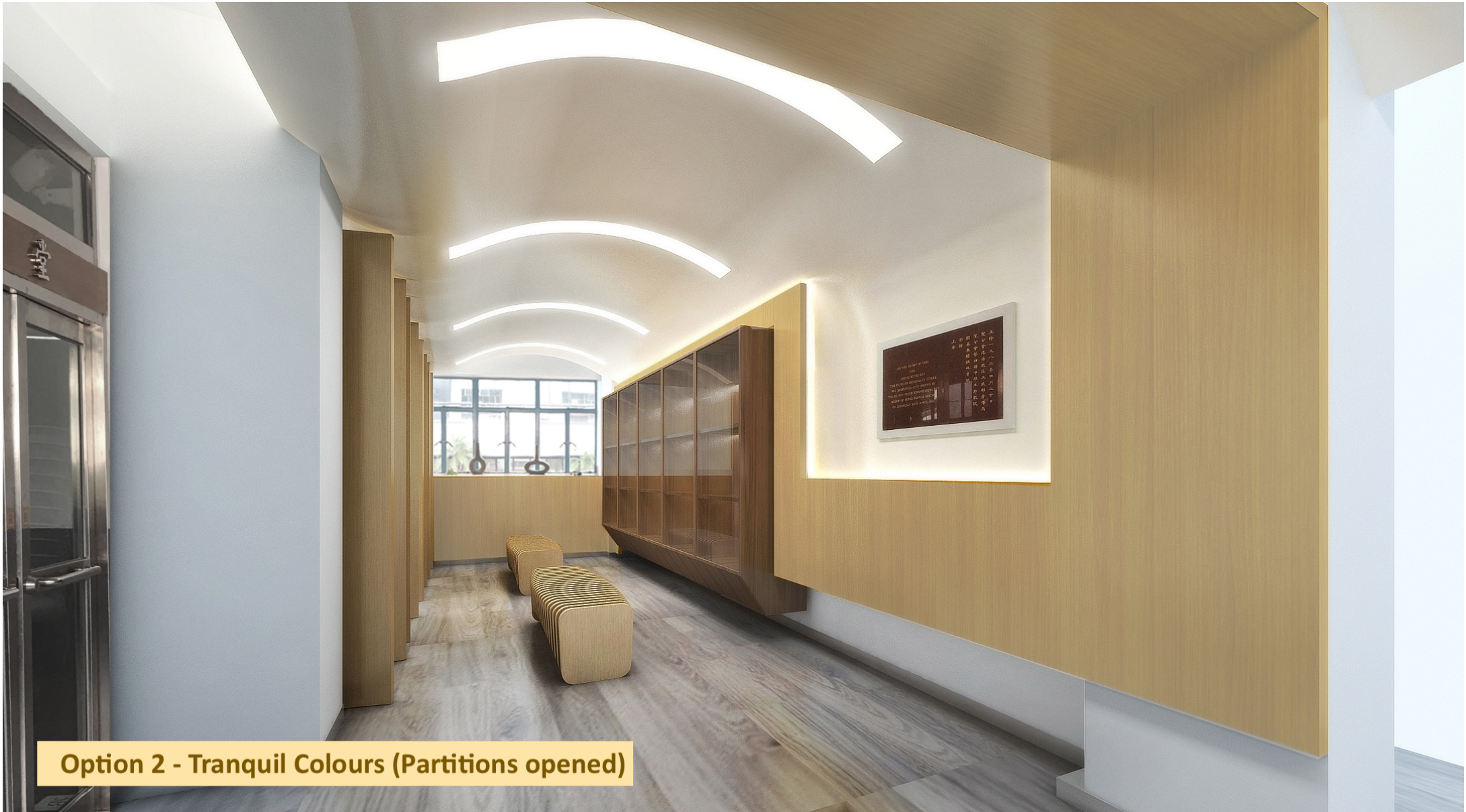
Option 2 - Tranquil Colours (Partitions opened)