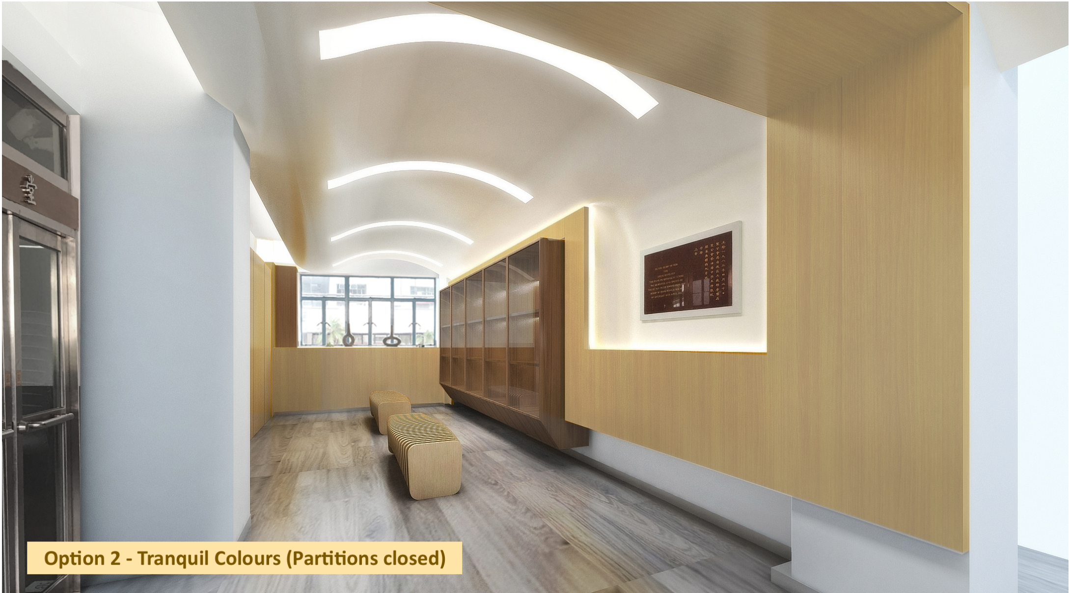
Option 2 - Tranquil Colours (Partitions closed)